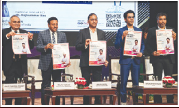
(Renowned Bollywood actor Shri Rajkumar Rao exchanging MoU with the Hon'ble Commission)