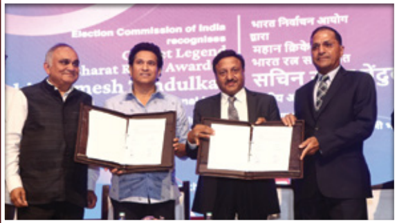
(Bharat Ratna Shri Sachin Ramesh Tendulkar exchanging MoU with the Hon'ble Commission)